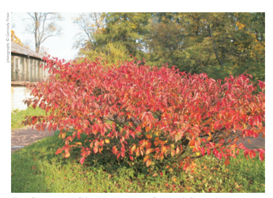
Above Cerasus nipponica. Below right Acer japonicum. Bottom right Photinia villosa.

Autumn is the season of great change for deciduous conifers. The metamorphosis in colour from green to gold takes place gradually. The European larch remains green for a long time and its needles are the last to fall. The blue and yellow colours go well together. Evergreen conifers with their dark green or silvery blue needles enhance the effect with the bright tones of the deciduous ones.