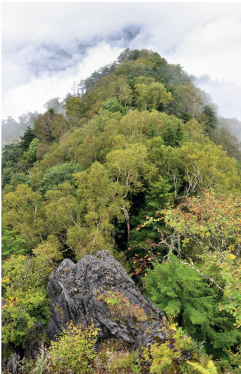
Population of Betula chichibuensis extending out over rocky limestone outcrop in Saitama Prefecture.