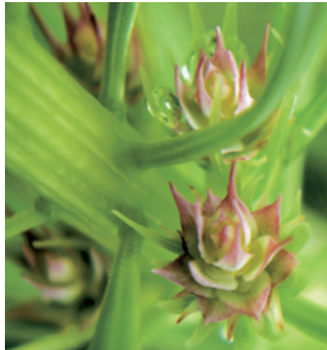
Above , rarely observed receptive flowers of Cathaya , awaiting a dusting of pollen during spring from male strobili, on the older shoots below, left , or from an adjacent tree.