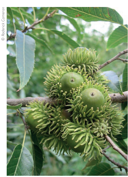
The striking acorns of Quercus acutissima ; a species from section Cerris , the second section to be published online in 2021.

Finally, 2021 delivered a satisfying 'proof of concept' that IDS Trees and Shrubs Online is the ideal format for generating and disseminating upto-date knowledge about temperate woody plants. New text for Eucryphia