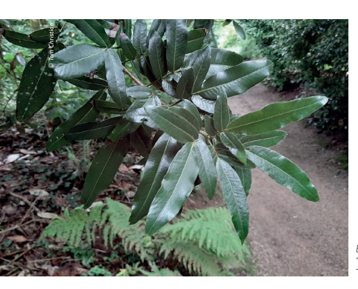
Eucryphia × splendens 'Madron' foliage at Trengwainton in Cornwall.

horticultural literature has either been necessarily vague about it, or in recent years has ceased to mention it entirely and it has been assumed lost. Since <code>Eucryphia</code>'s 2018 revision I have had the opportunity to visit Trengwainton where, against all odds, I re-discovered this beautiful long-lost plant. The whole unlikely story was written up for the RHS journal <code>The Plant Review</code> and can be found on TSO under the entry for <code>Eucryphia × splendens</code>. Because IDS Trees and Shrubs <code>Online</code> is web-based, and not a physical publication like a book, there is no need to wait several years for the next edition to put useful information out into the public domain: we were able to draft and publish a new account of <code>E</code>. 'Madron' as soon as <code>The Plant Review</code> article was published.