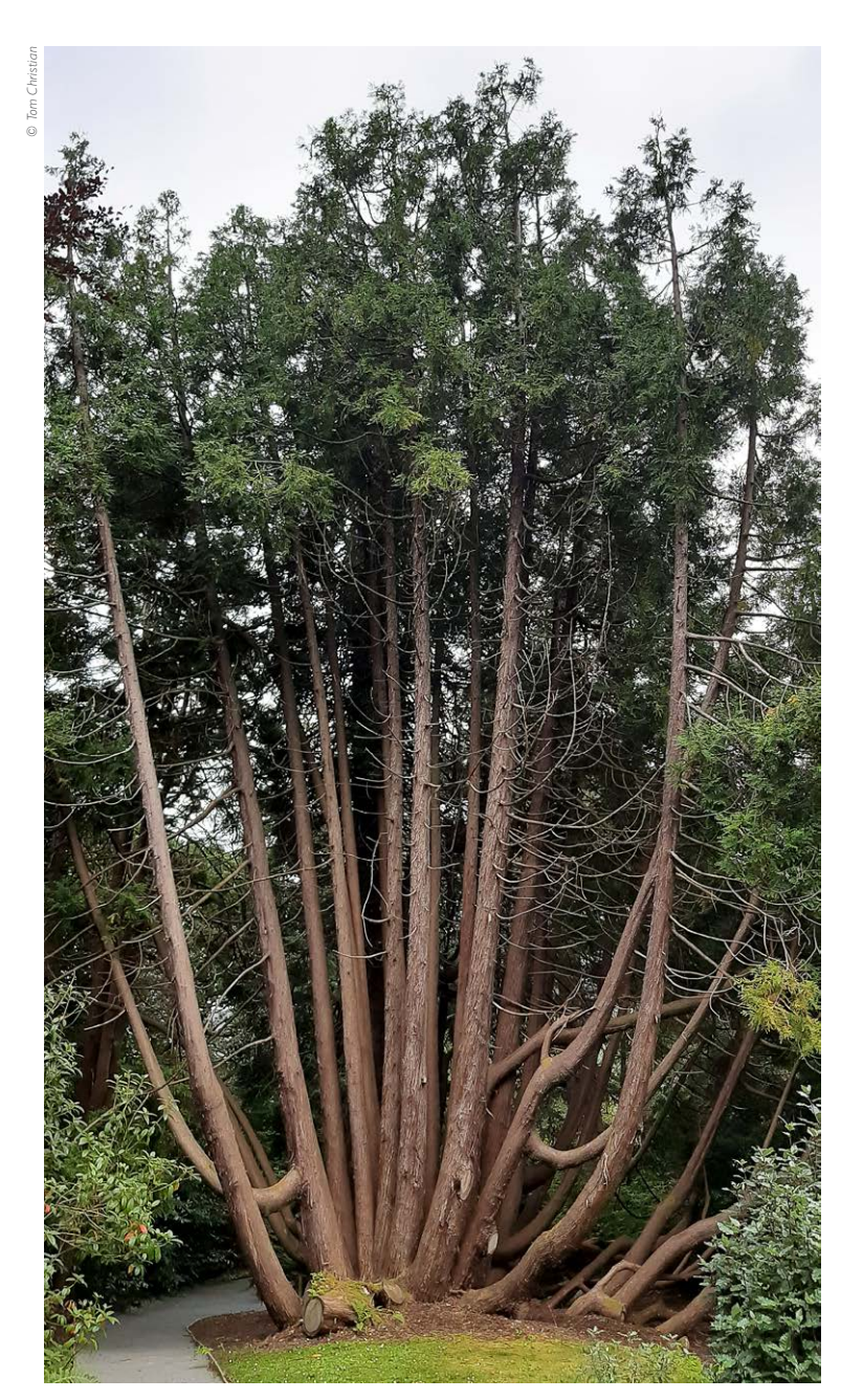
A monster Thujopsis dolabrata at Leckmelm, in northwest Scotland.

of misunderstandings, denunciations, attacks, vilification, innuendos, libel, slander, and outright lies'!