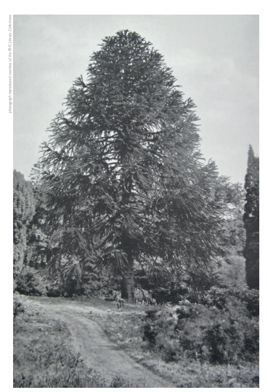
The Dropmore tree, photograph taken 1903 and published 1906 (by which time the tree had been felled) in Trees of Great Britain and Ireland by Elwes and Henry.