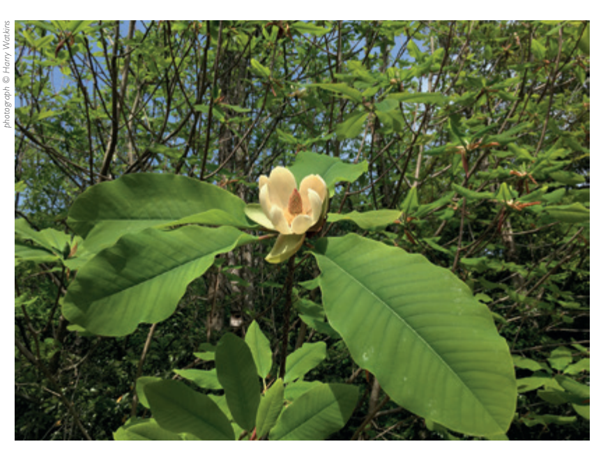
Magnolia obovata, largely indifferent to its climate in Kaisho Forest, near Seto.

Finding the most appropriate places for Magnolia species in urban environments, from (Watkins et al. , 2021). The letters in brackets after the species name refer to the species ordination with CSR space (Grime and Pierce, 2012).