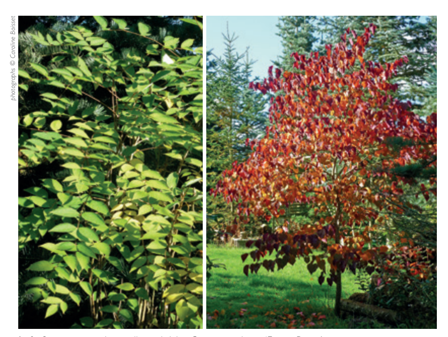
Left, Stewartia pseudocamellia and right, Cercis canadensis 'Forest Pansy'.

spacings (I know it is too close but thinning will take place—either naturally or by intervention as time goes by) and used the space in between for Christmas trees. Now I hope to change this understorey by using shrubs to add more interest as well as shelter. The tree collection is on the eastern side of the plot whilst the west side continues to grow Christmas trees with the idea that sales can help pay for maintenance—particularly important as both my husband and I grow older and to secure the future for Little Friars Arboretum. It is probably optimistic and sounds pretentious but I think one of the aims of any project should be self-financing and where possible, create employment opportunities too. The rabbit proof fencing put in for the Christmas trees was a boon when planting specimen trees, although it now needs frequent repairs. However I discovered deer are great dendrologists as they seem to find the rarest of trees to munch upon so now the rabbit fencing has been topped with electrified fencing rope. This was used instead of wire because of the habit of deer to inspect barriers which therefore should be easily seen and the deer then remembers it has a sting so they stay clear, even though they could in fact leap the height.