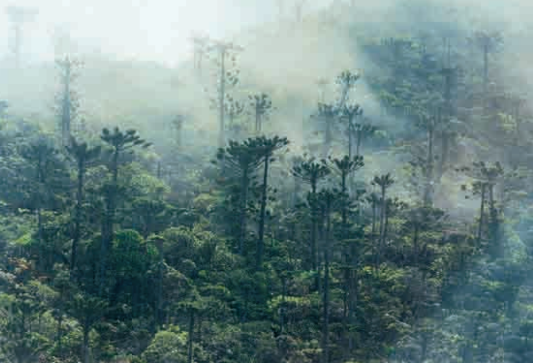
Above: Araucaria humboldtensis on Mt Humboldt, emergent above evergreen montane forest. (p.30) Below: Houp ( Montrouziera cauliflora ), one of the biggest trees in the New Caledonian rainforest. Seen here at Col d'Amieu (p.29).