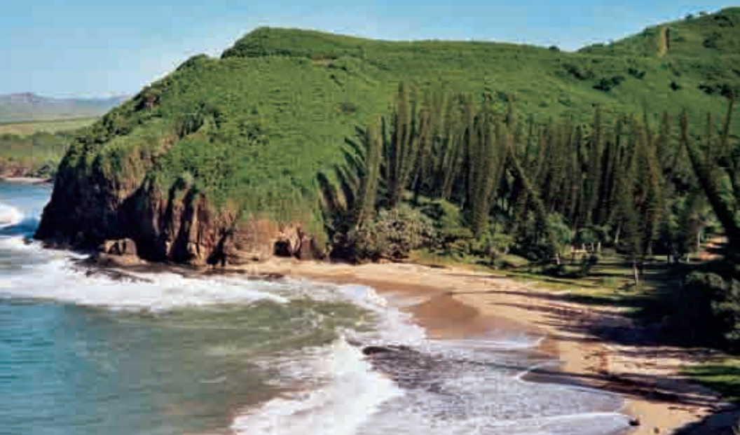
Above: Pin colonnaire ( Araucaria columnaris ) at Parc du Lagon de Bourail, Baie de Tortues (p.18). These trees are planted. The hillside scrub is dominated by the introduced Leucaena leucocephala . Below: La Chute de la Madeleine botanical reserve - growing here are Retrophyllum minus , Dacrydium guillauminii , D.araucarioides , Neocallitropis pancheri and Podocarpus novaecaledoniae . Nearby can be found Agathis ovata and Araucaria bernieri (see p.26).