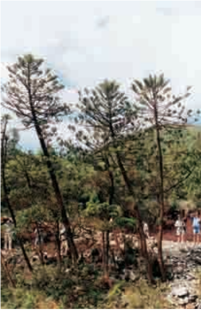
Araucaria scopulorum , between Col d'Amieu and Houaïlou. (p.18) Below: Agathis lanceolata , Parc Provincial de la Riviere (p.23).