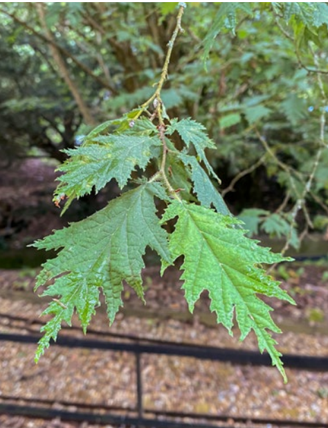
Below: Corylus avellana 'Urticifolia', champion example of cut-leaved hazel