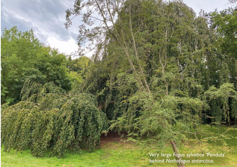
Very large Fagus sylvatica 'Pendula' behind Nothofagus antarctica .