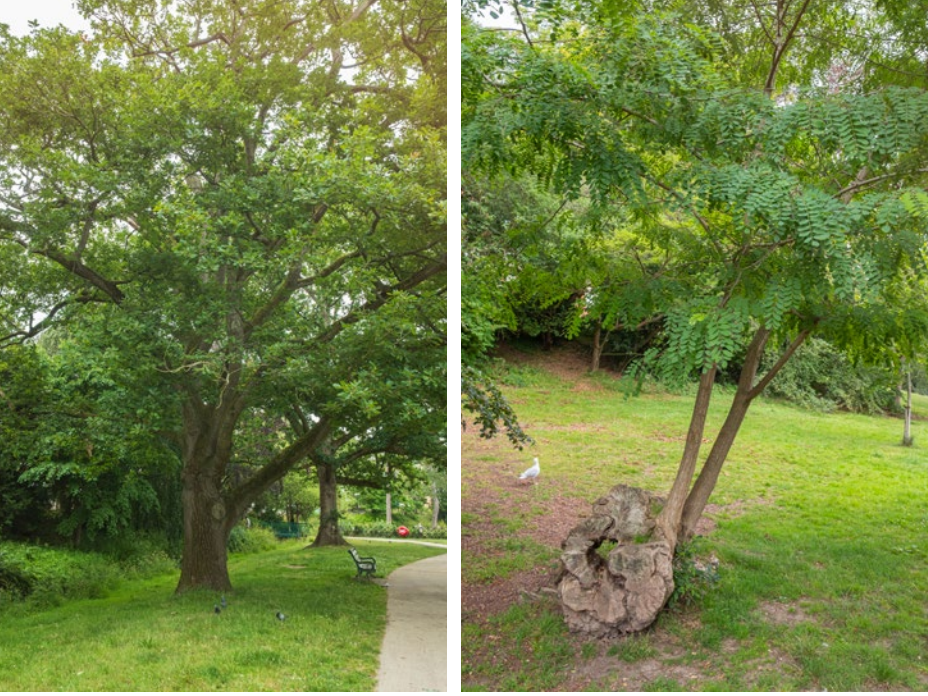
Left: Quercus petraea , 1911 Coronation memorial planting; right: Robinia pseudoacacia stool