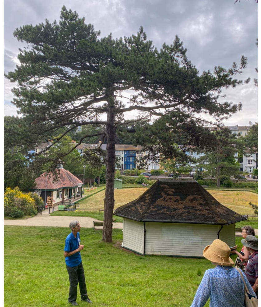
Owen Johnson and a veteran Pinus nigra subsp. nigra planted in the 1870s.

Because of the limited range of trees available as standards, and the lack of familiarity of many Tree Officers with the vast potential range of rare species that might be planted at smaller sizes, tree populations in public places often lack variety. Monocultures are always vulnerable to pests and diseases, and to changes in climate; an opportunity is also missed to create beautiful and diverse landscapes, and to engage local people in their environment