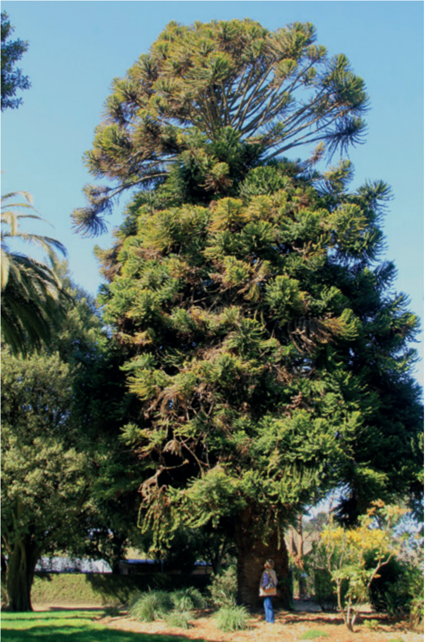
Araucaria bidwillii growing in Colac Botanic Gardens in south-west Victoria. Note the classic 'public-park' form of architecture with the domed top and denser new growth lower down.