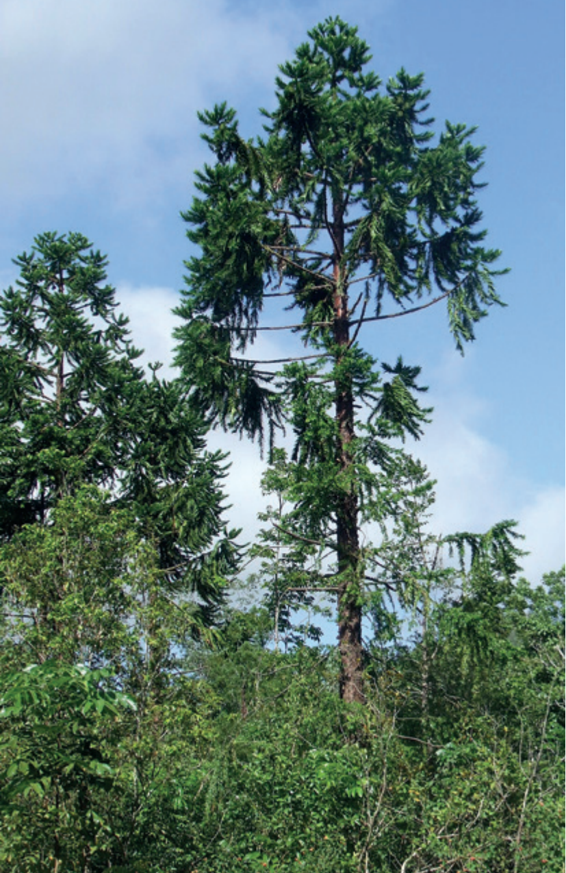
A surviving Araucaria bidwillii , about 20 m high, in a forestry plantation, Nandarivatu, Fiji, in 2010.