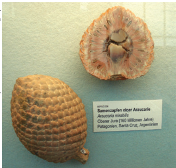
Cone of the extinct Araucaria mirabilis . Palaeontological Museum, Munich.