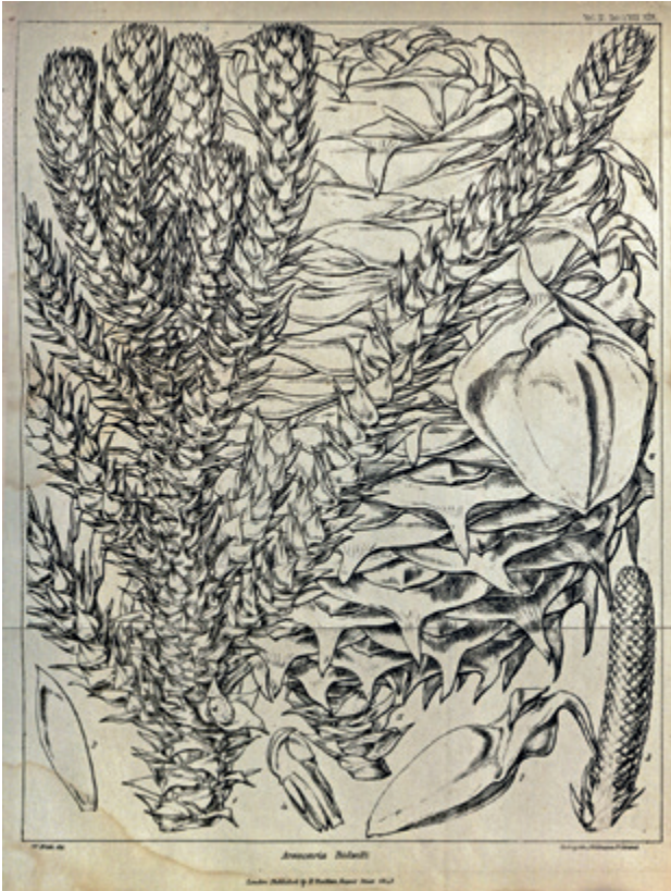
Walter Fitch's plate which accompanied the original botanical description of the species. London Journal of Botany (1843).

solid cones as big as a person's head that can weigh a potentially murderous 10 kg. Nevertheless, the first-hand input by John Bidwill describing the tree in the wild, together with Hooker's accompanying notes and an exceptionally fine plate from the hand of Walter Fitch, did do the new Araucaria bidwillii some justice!