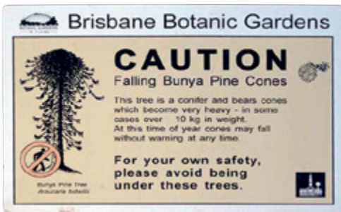
A typical warning board as seen in Australian public parks and gardens.

[ https://www.upi.com/Odd_News/2015/10/13/Man-injured-by-16-pound-pine-cone-suing-for-5-million/3621444757783/ ]. Needless to say public authorities sadly appear to be culling even heritage trees whenever any risk of legal liability is raised. Perhaps, more awareness promotion would be preferable.