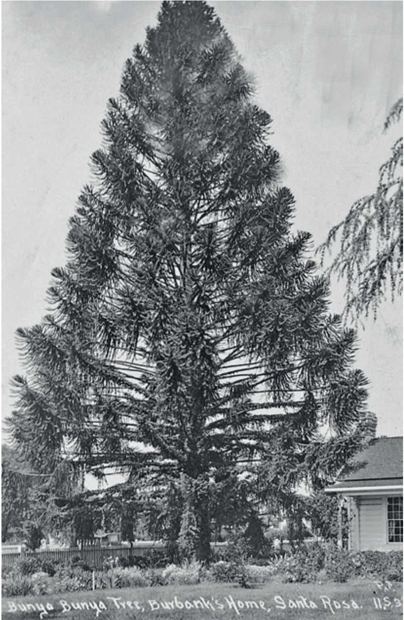
A postcard, circa 1920 of a Bunya-pine in the Luther Burbank garden in Santa Rosa.