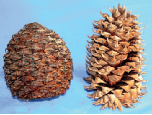
Left , a small cone, this example is only 20 cm in length, of the Bunya in comparison with that of Pinus coulteri (right). From the author's garden. Large cones of Araucaria bidwillii can be 30 cm in length.