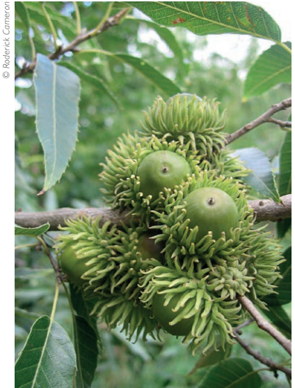
The striking acorns of Quercus acutissima ; a species from section Cerris , the second section to be published online in 2021.

Finally, 2021 delivered a satisfying 'proof of concept' that IDS Trees and Shrubs Online is the ideal format for generating and disseminating up-to-date knowledge about temperate woody plants. New text for Eucriphia was published on the website in 2018, but at that time a mysterious cultivar, 'Madron', remained shrouded in mystery. Raised at Trengwainton, Cornwall, sometime prior to 1954, it was exhibited that year but its parentage was never recorded, and seemingly it was never distributed. Since then, classic