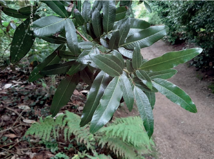
Eucryphia × splendens 'Madron' foliage at Trewgainton in Cornwall.

horticultural literature has either been necessarily vague about it, or in recent years has ceased to mention it entirely and it has been assumed lost. Since Eucryphia's 2018 revision I have had the opportunity to visit Trewgainton where, against all odds, I re-discovered this beautiful long-lost plant. The whole unlikely story was written up for the RHS journal The Plant Review and can be found on TSO under the entry for Eucryphia × splendens . Because IDS Trees and Shrubs Online is web-based, and not a physical publication like a book, there is no need to wait several years for the next edition to put useful information out into the public domain: we were able to draft and publish a new account of E. 'Madron' as soon as The Plant Review article was published.