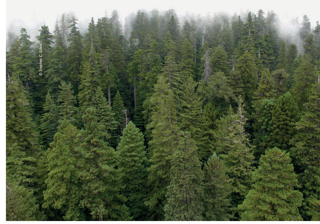
Figure 1 Primary forests dominated by Sequoia sempervirens , such as this example from Redwood National Park, California, hold global maximum aboveground biomass (up to 4,340 metric tons per hectare), carbon storage (up to 2,200 metric tons per hectare), and leaf area (leaf area index > 20). These are also the world's most productive primary forests, producing up to 19 metric tons of aboveground biomass annually, 80% of which is decay-resistant heartwood.

Trees bear witness to the passage of time with increasing size and structural complexity. Dead spire tops, replacement trunks, and gnarly limbs arise after crown damage, and as trees age, they become recognizable as individuals.