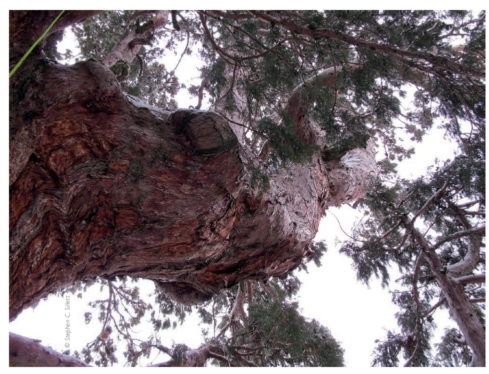
Figure 3 Giant sequoia (Sequoiadendron giganteum), which stands up to 96 meters tall, is the longest-lived of the four conifers by virtue of unrivalled fire resistance and extremely durable heartwood. This enormous limb emerges from a trunk 44 meters above the ground, where it is over two meters diameter and approximately 3,000 years old.

Declining growth efficiency eventually results in a decreasing rate of biomass production at the tree level. When growth efficiency falls too low, a tree