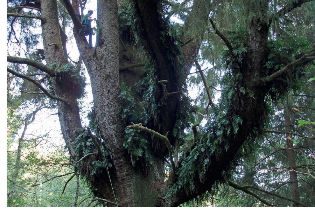
Figure 4 Sitka spruce ( Picea sitchensis ), which stands up to 100 meters tall, has the shortest maximum longevity (< 500 years) and is least protected against fire and decay. Here is one of the largest specimens in California with Steve for scale. Its massive limbs support sprawling mats of the evergreen fern Polypodium scouleri .

Intentional forests could be created and nurtured at various scales. At the