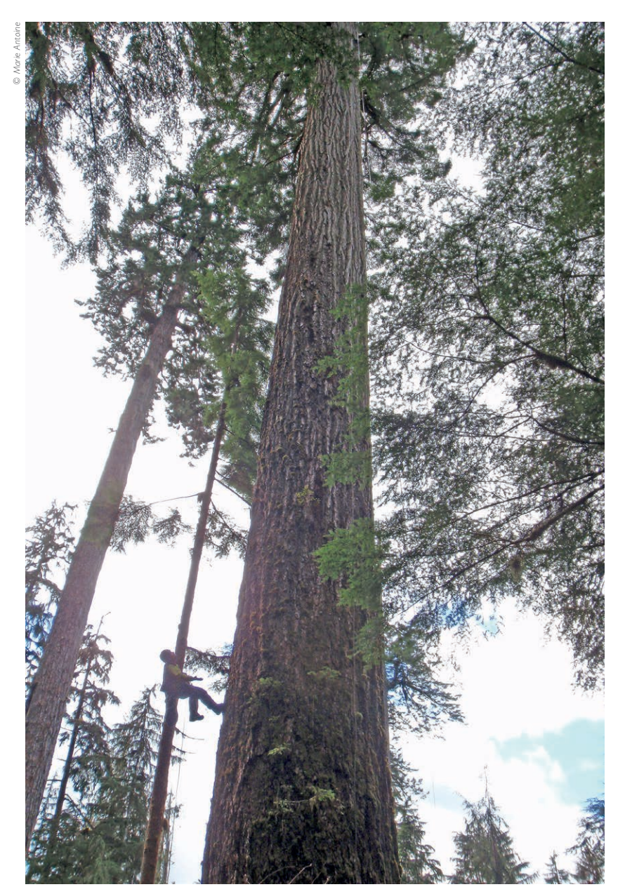
Figure 5 Douglas-fir ( Pseudotsuga menziesii ), which stands up to 99 meters tall, can live twice as long as Sitka spruce and is moderately protected against fire and decay. Here is one of the largest specimens with Steve for scale.

Coast redwood has incredible regenerative capacity. It is one of the few stump-sprouting conifers, which makes this species an ideal candidate for populating temperate forests of the future. The carbon locked up in its heartwood will resist decay for centuries to millennia if not consumed by fire. Other long-lived species within the same group (cypress family) might also