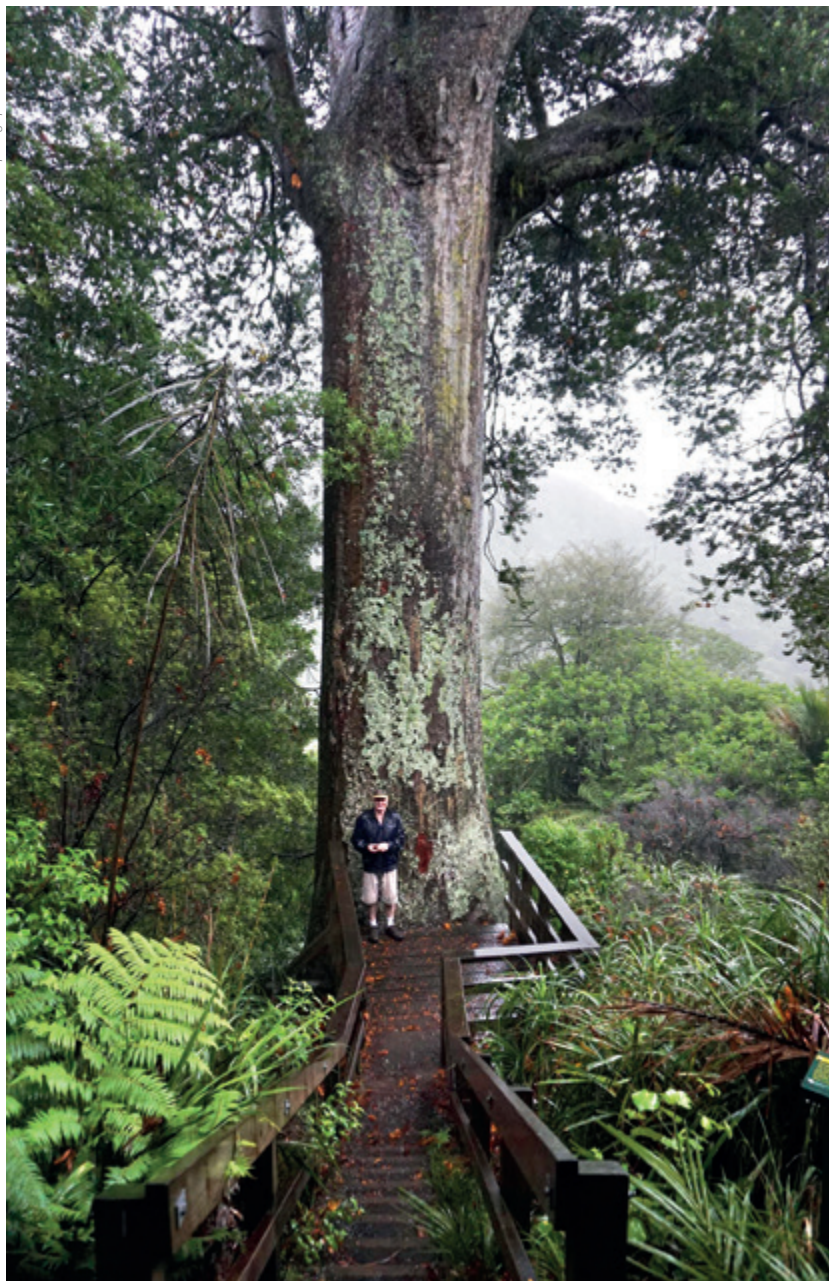
Hakarimata, the 1,000 year-old Kauri near Huntly in the Waikato region of New Zealand.

garden. From the front door, you stepped down to a circular lawn surrounded by a box hedge and a path led down to the road frontage. There were a couple of orchards as well. Much of the area was left to nature and a small number of large trees, native and exotic, grew in these areas, notably Puriri, Pohutukawa and Rimu. Shrubby trees like Karo, Tarata, Kohuhu and Totara also grew in these areas and proved to be ideal for little children to play hide-and-seek in.