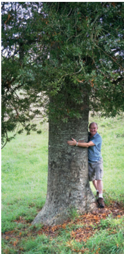
The younger of two Kauris in 2017 on the 'Surrey Hills' farm which was 20.4 m tall and had a diameter of 86 cm.