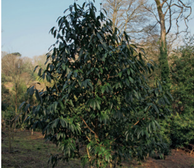
Above, left, a sparsely-leaved M. doltsopa seedling and right, a densely-leaved M. doltsopa seedling, both at Caerhays.