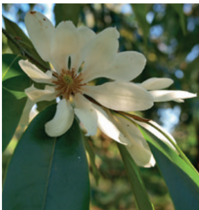
A young Michelia floribunda tree at Tregrehan.

When you compare these pictures to those of the Caerhays plants earlier in this article can you really base the identification of two species simply on leaf scar length while ignoring history, flower colour, habit and performance? I have to admit to rather doubting this simple conclusion. Furthermore, in more mature branches on the older trees at Caerhays you can find plenty of leaves of both species with no leaf 'scar' at all.