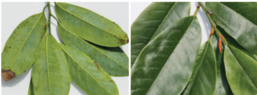
Leaves from the three unnamed species