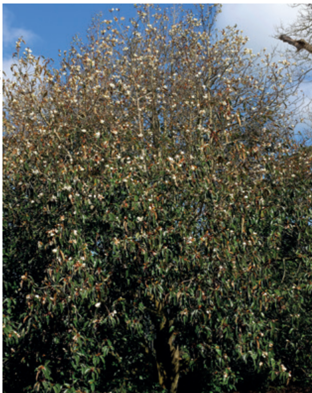
One of the huge Magnolia doltsopa ( Michelia doltsopa ) at Caerhays Estate in March 2016.