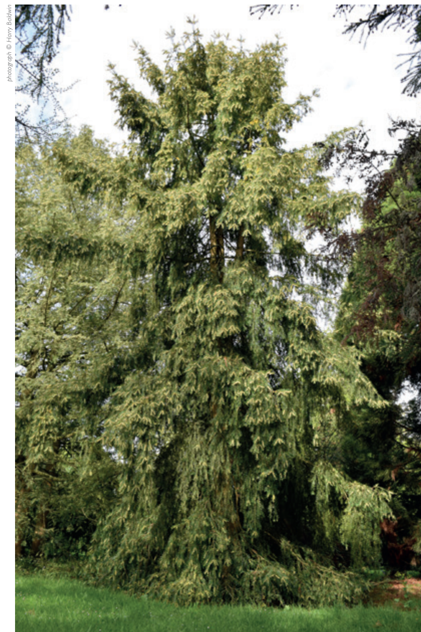
One of several specimens of Torreya nucifera at Royal Botanic Gardens, Kew (photograph taken in mid April 2020).

'Hadakagaya' (f. nuda ). The seeds lack the outer coating, but however seedlings do not exhibit the same 'naked' trait in their nuts once they produce