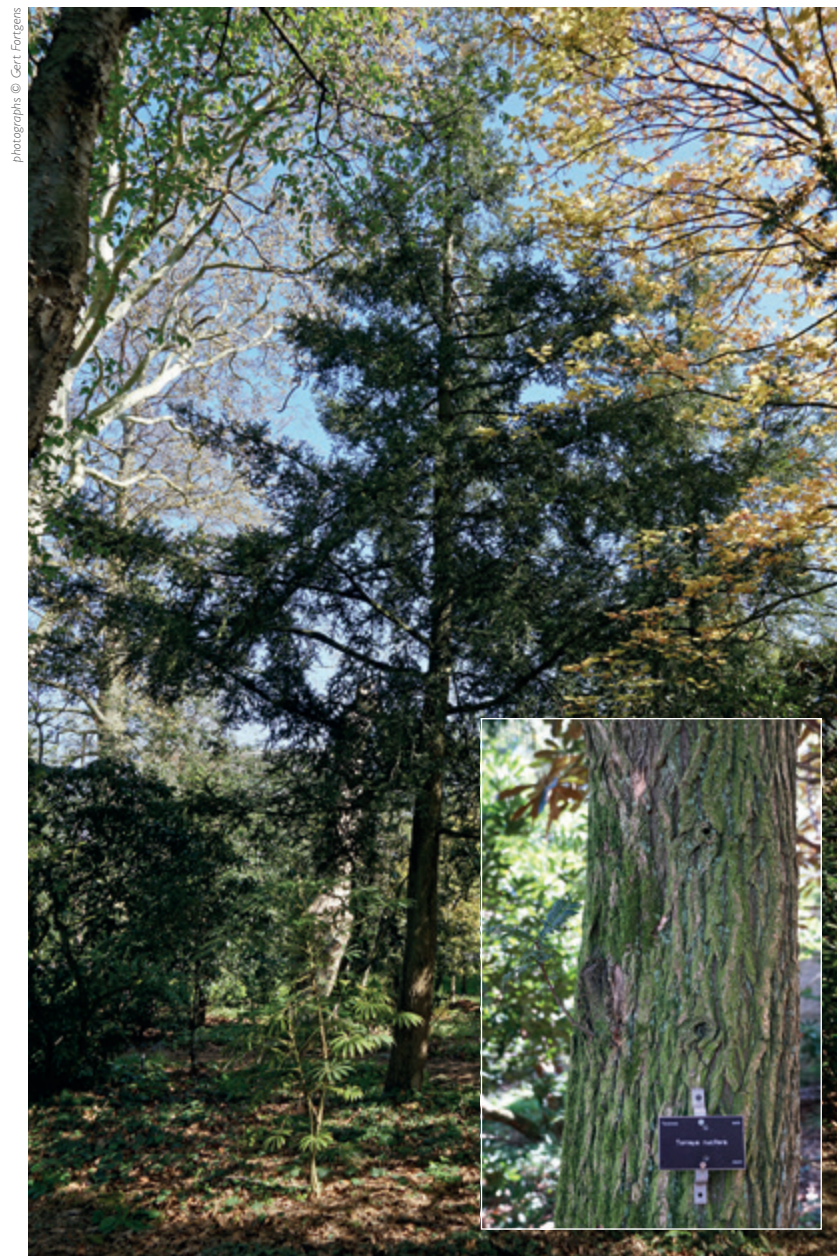
Above, Torreya nucifera growing at Trompenburg Arboretum in Rotterdam, Netherlands (see p. 45). Inset is the deeply fissured bark of the tree.