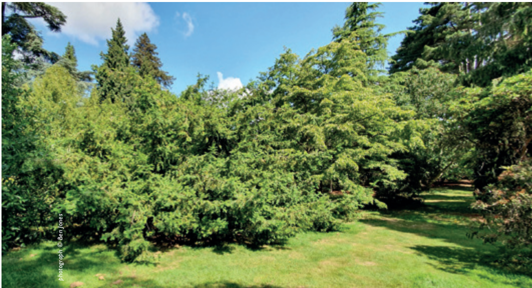
Opposite, Torreya nucifera , planted in the late 1970s, at Harcourt Arboretum, Oxford.