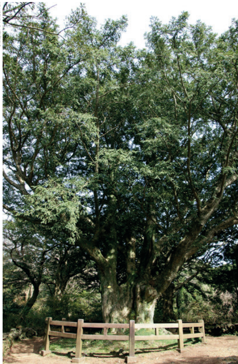
One of the champion Torreya nucifera is over 820 years old, photographed here in 2010 on Jeju Island in South Korea (see pp. 48–49).