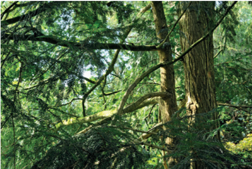
Torreya nucifera at Arboretum Kalmthout in Belgium.