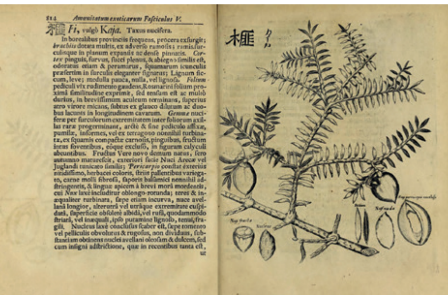
Probably the first illustration of Torreya nucifera published in 1712 in Amenitatum exoticarum .