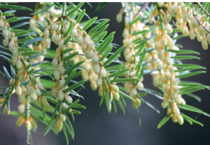
The male strobili of Torreya nucifera on a tree at RBG Kew taken in mid April 2020. They appear during the winter in double rows along the underside of branches and can be present on different branches from female cones.

1.5–2.5 × 0.22–0.30 cm, linear, stiff, gradually tapering to short spinescent apices, deep green and lustrous, pale green underneath with two narrow pale yellow stomatal bands. Fruit ellipsoidal (to 1.5 in. long), dark green, ripening in the second year with purple blush, single seed covered by a fleshy aril.