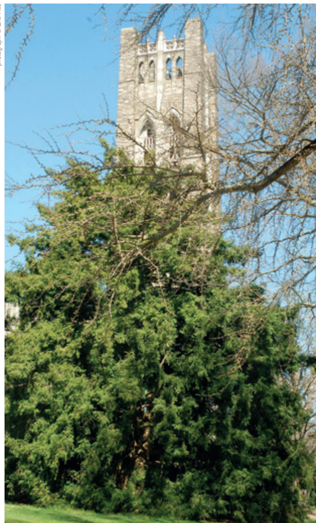
Torreya nucifera at the Scott Arboretum, Swarthmore College, in Pennsylvania.

0.60 m will hopefully replace the original mother tree.